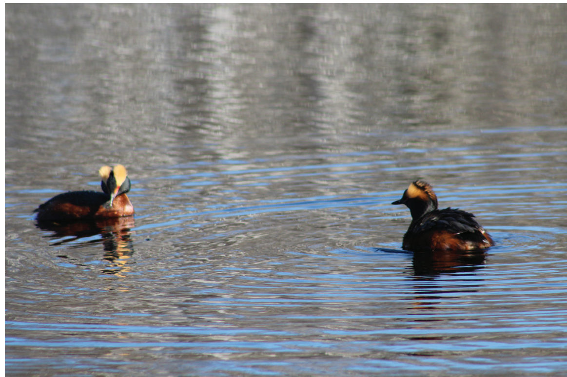
Horned Grebes in the Goldstream Greenbelt.